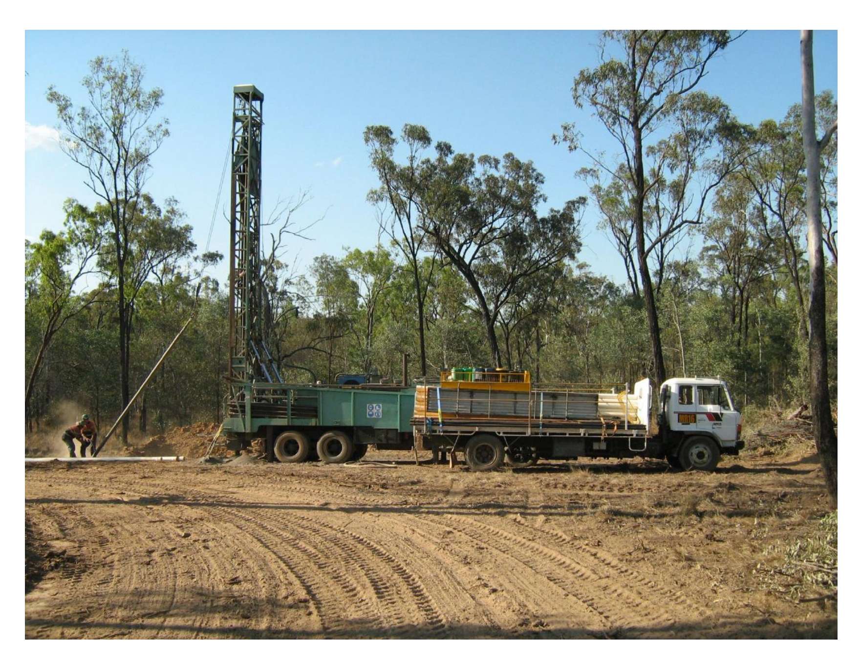
Commencement of Drilling EPC 1548 "West German Creek" 25 October 2011