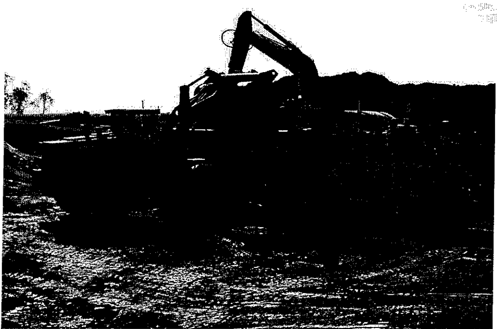
(Contractors loading side tippers for delivery to the drying pads – May 2008. The equipment shown are not assets of PEV))