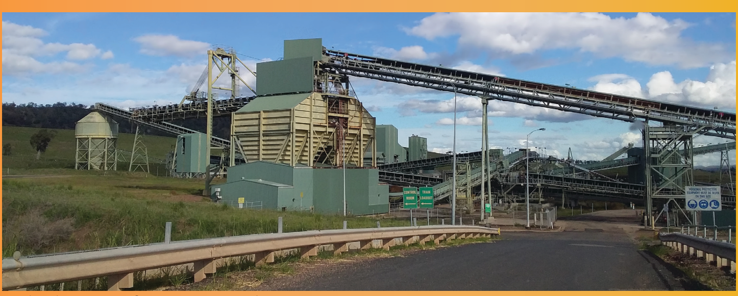
Dartbrook East Site Infrastructure, currently in Care and Maintenance.

It is hoped that a way forward can be found such that the very material social and economic benefits of the recommencement of limited underground mining at Dartbrook can be realised by the local community and the state of NSW.