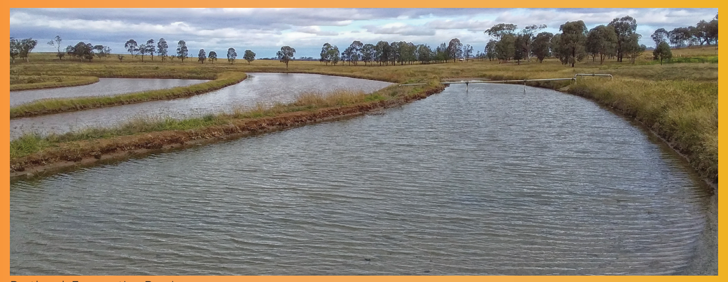
Dartbrook Evaporation Ponds.